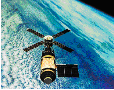
Fig 3 This satellite is a still image from Video 1 (Video 1, MPEG, 2.5 MB).

size for each video file is 10-12 MB. Authors may insert a representative still image from the video file in the manuscript as a figure. The caption label will be linked by the publisher to the actual video file. The video may also be mentioned in an existing figure caption. Multimedia files are treated in the same manner as figures and they will be numbered sequentially with normal figures. The video number, file type, and file size should be included in parentheses at the end of the figure caption. See Figure 3 for an example.