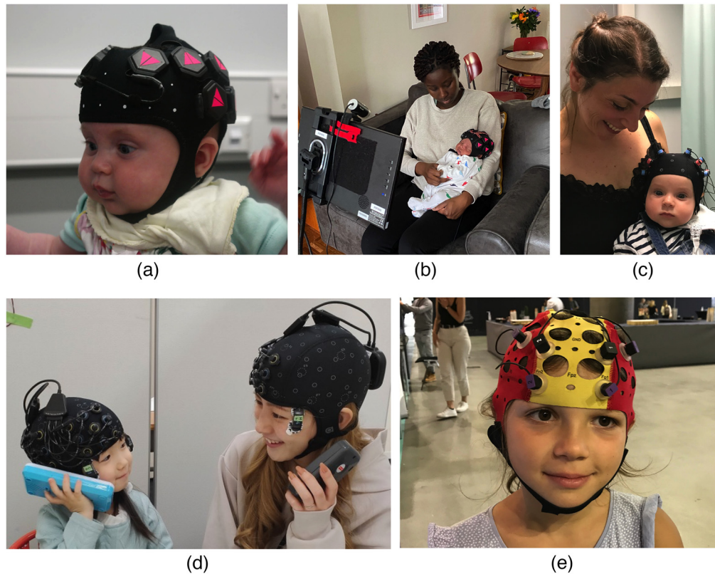
Fig. 2 Families taking part in studies using wearable fNIRS systems: (a) at a research lab visit (LUMO, Gowerlabs) and (b) during a home visit as part of the longitudinal PIPKIN Study, 36 (c) in a lab study on language development (NIRSport 2, NIRx), while (d) hyperscanning mother and child (Brite MKII, Artinis) combined with a wireless EMG system (pico EMG, Cometa; at the outer corner of the eyes) to measure facial muscle activity, and (e) while freely locomoting inside a building (PHOTON, Cortivision).