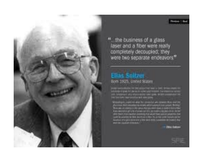
Figure 3 Elias Snitzer, American Optical, developed laser glass and the glass fiber laser