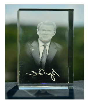
Figure 23 George W Bush, viewed from the back

Figure 22 George W Bush, 43rd President of the US; viewed from the front