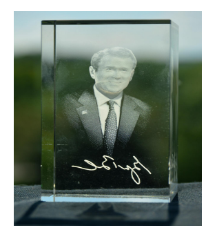
Figure 24 George W Bush, viewed from the back but more from one side