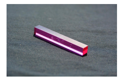
Figure 7 Ruby sample used by Giuliano to characterize laser damage tracks; 6mm x 6mm x 50mm