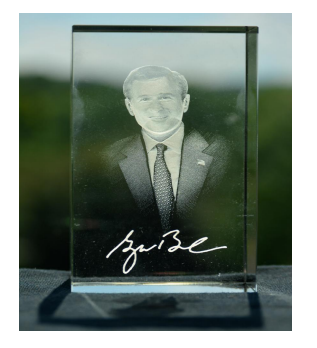
Figure 22 George W Bush, 43rd President of the US; viewed from the front