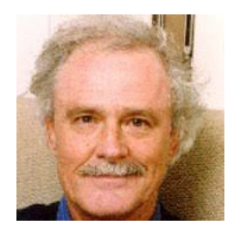
Figure 4 Bob Hellwarth, Hughes Research Lab, inventor of the Q-switched laser