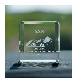
Figure 21 Thirtieth anniversary meeting gift: laser damage in glass