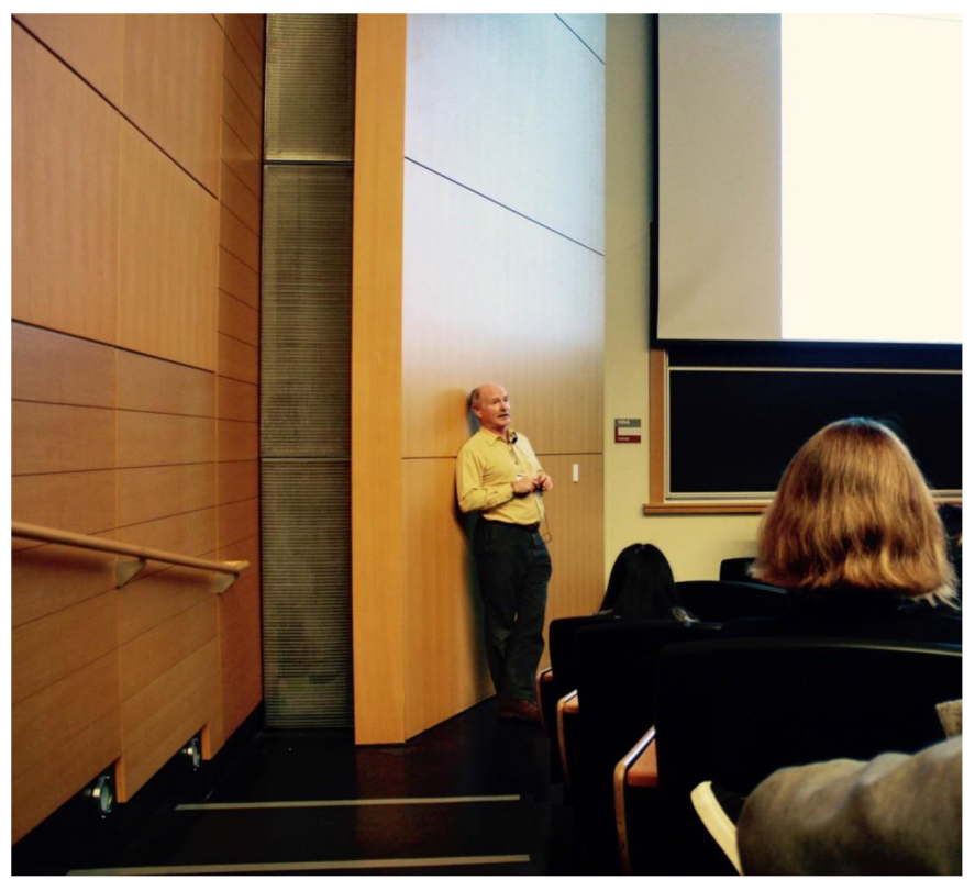
Rafael Yuste is a key figure in inspiring the White House to sponsor the BRAIN initiative