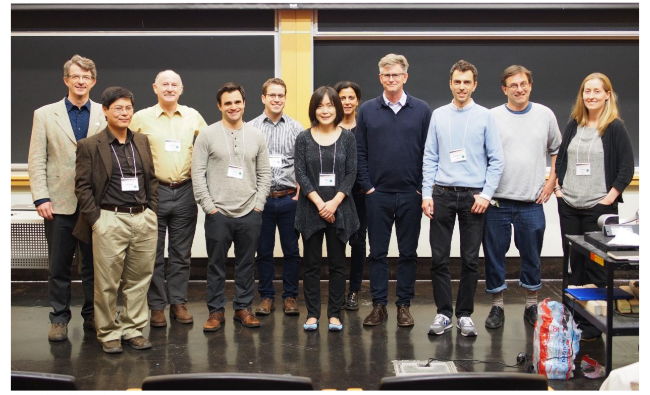
The SLB2017 speakers.