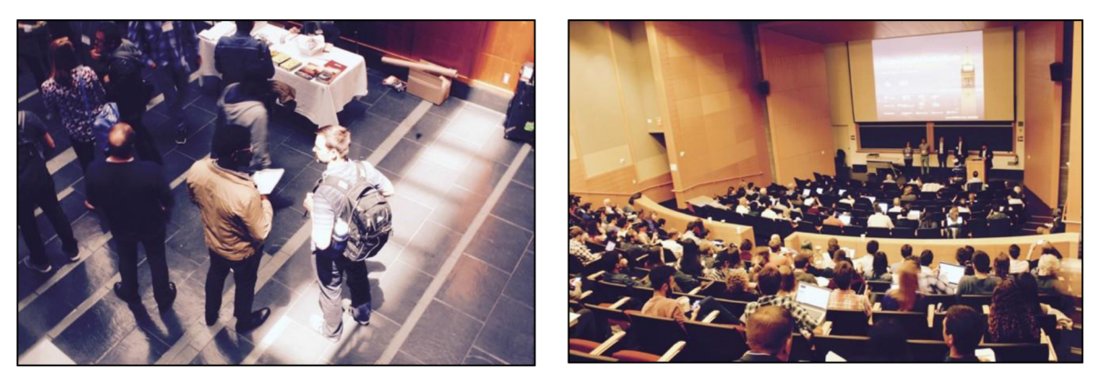
Stanley Hall is the venue for structured light in the brain, with a generously lit foyer

dimensions to stimulate consequent behavior and the ability to probe neural signal patterns for a given behavior. Once the neural patterns are known for particular behaviors, correlations between the stochastic, highly correlated neural networks and the emergent mind — logical but also unpredictable — will allow characterizing and engineering consciousness from its structural building blocks.