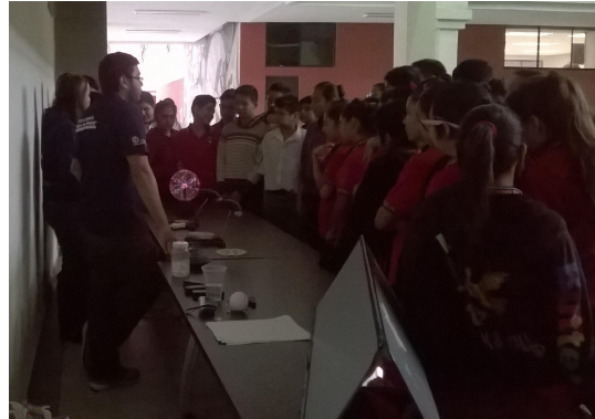
Figure 9. Optics demonstrations at National Week of Science and Technology 2015.

light effects and colors. During this particular event a light ball that separate the colors and gel balls were included. The Figure 9 show a picture of the students presenting the experiments.