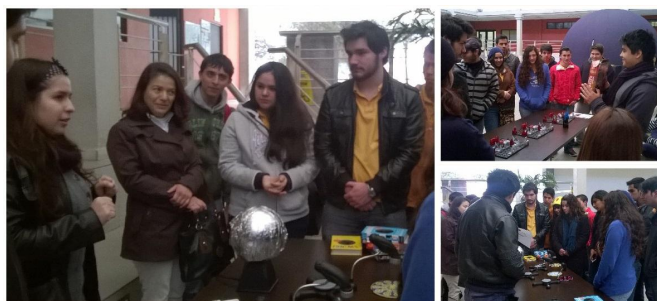
Figure 3. Optics demonstrations with high school students.