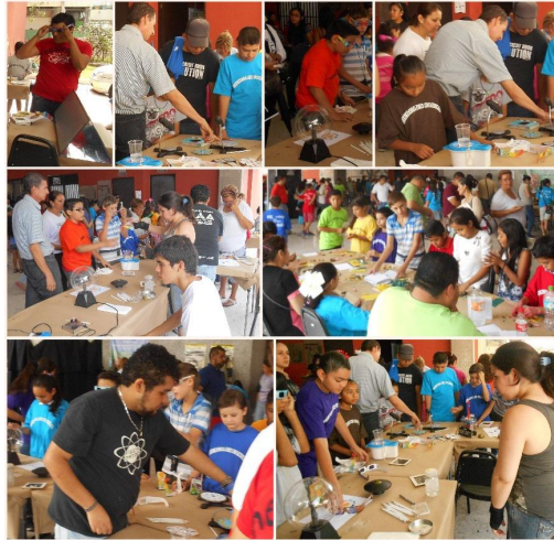
Figure 5. Science in family 2015. Event organized by the Education Secretary in the Nuevo Leon state. The group "Physics for everyone" presented different demonstration related with Optics.