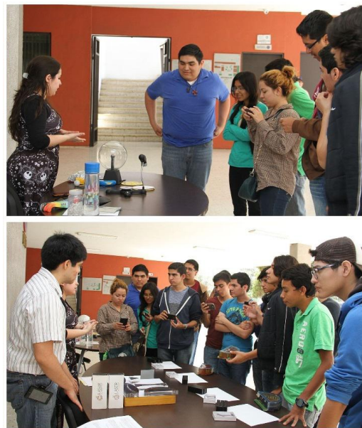
Figure 10. Hands-on activities with bachelor students from the Instituto Tecnológico de Ciudad Victoria.

Bachelor students from the Technological Institute of Ciudad Victoria City visited the Faculty facilities on October 27 th . During this event, activities like the plasma ball, strobe light effects, IYL2015 diffraction grating lenses and light blox were shown. In addition, during the light blox activity, acrylic lenses and laser lights were shown to replicate the light blox lenses, so students can try the different lens configurations. The figure 10 show pictures of this event.