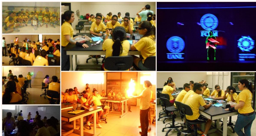
Figure 6. Optics outreach activity during the summer camp "Little Bisons". During the summer camps the kids and teenagers done hands-on activities related with color and light phenomena. In addition, they enjoyed of one black-theater performance.

The summer camp Bisontitos or Little Bisons is held each year at Facultad de Ciencias Fisico Matematicas on July and is 2 weeks long. During this event, several hands-on experiments and demonstrations were shown to kids from 6 to 14 years old, due to the time of each lab class (40 minutes) the experiences in this event were huge. The activities included color, fluorescence and phosphorescence. In this event, the color activity was longer than the past events, it included the IYL2015 diffraction gratings were the students use the gratings to see different color lights and even fire as the Figure 6 shows, one interesting phenomenon is when a laser light is shown, this particular experience demonstrate the difference between light and laser light. Also, a particular activity was included, in the color activity a stereoscopic diffraction lenses were included, the objective was an experience were the students draw in a black paper and make their own 3D draws with warm colors on the bottom and cold colors on front. In addition, during the class the difference about phosphorescence, fluorescence and chemiluminescence was explained and, later, during the night closing event, the kids enjoyed a black-theater performance.