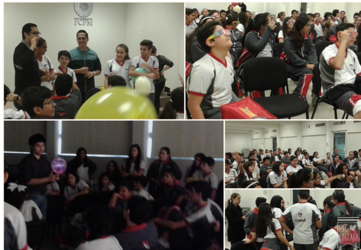
Figure 12. Hands-on activities about color and light during the visit of the Collage Ingles Americano at the FCFM facilities.

On November 13 th , the Colegio Ingles Americano visited Facultad de Ciencias Fisico Matematicas. During this event, activities like color, plasma ball, IYL2015 diffraction gratings lenses were shown as the Figure 12 show. During this event, the static electricity was linked with the plasma ball with a particular activity, stick a balloon to a wall with static electricity.