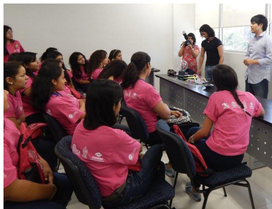
Figure 7. Women in Science UANL. Hands-on activities related with Optics and its application in daily life.

The program Woman in Science is a University program where high school students visit the university research centers. This event was on September 25 th and October 2 nd . The activities in this event included the microscope, colors and plasma ball. In addition, lenses were shown and explained to students.