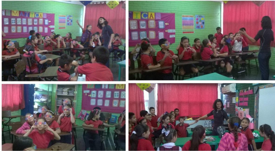
Figure 11. Hands-on activities about color, light, 3D and perception at the Elementary school Vicente Guerrero.