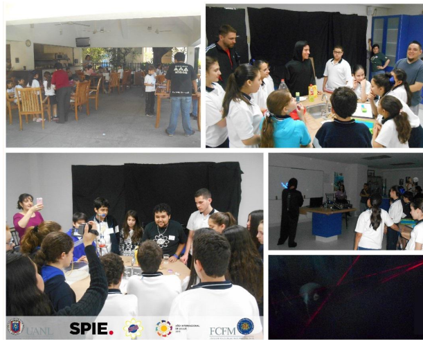
Figure 4. Celebrating the International Year of Light 2015 at the Nuevo Colegio Israelita de Monterrey. Optics demonstrations for basic education students with the purpose of learn about the importance of the IYL2015.