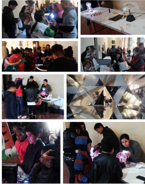
Figure 15. Science demonstrations about optical illusions, waves, 3D and light phenomena during the event "Night with the Stars" at the UANL facilities.

Looking for achieve a better understanding of the activities shown, it was necessary apply modifications with every event, public, activity and topic. The more complex activities were left to higher education levels.