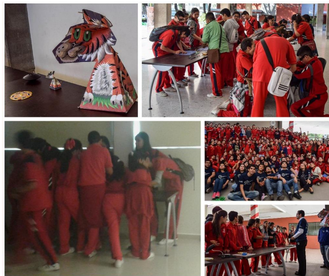
Figure 14. Hands-on activities about optical illusions, waves and light phenomena during the event "Optica Pato2 2015" at the FCFM facilities