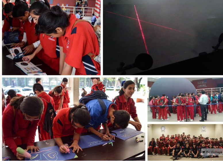
Figure 13. Hands-on activities about light, 3D, perception, laser safety and light phenomena during the event "Optica Pato2 2015" at the FCFM facilities.