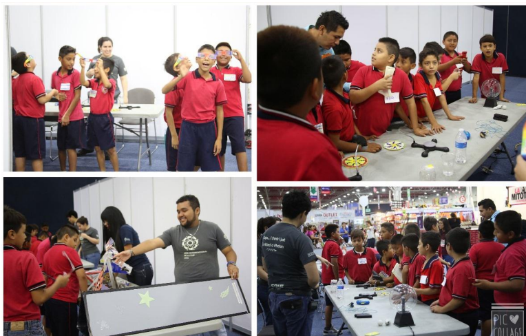
Figure 8. Optics demonstrations at the International Book Fair Monterrey 2015.

On October 16 th , the Monterrey book fair is held at the Convention Center Cintermex . During this event, the celebration of IYL was shown with the "Light: beyond the bulb" exhibit and a day of demonstrations to elementary school students. In this event, several schools visited the convention center making time limit activities. Strobe light effects, a kaleidoscope, colors and plasma ball activities were included.